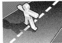
the middle of the road