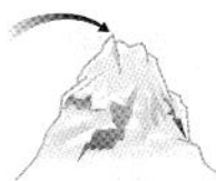
the top of the mountain