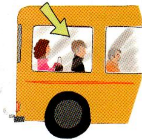
on a bus